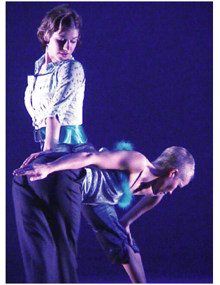
Duet one A navy sister act on the shores of Scandinavian winter gloom Two women. One is a Finnish gymnast and masseuse, the other an opera-hybridized- rock singer.